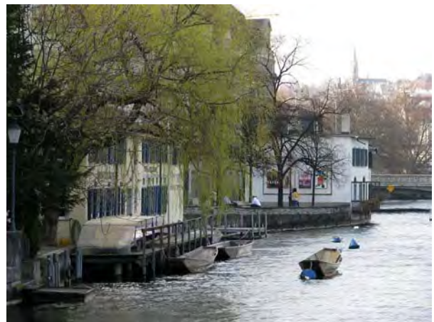
Zurich: Schipfe Houses, 2009